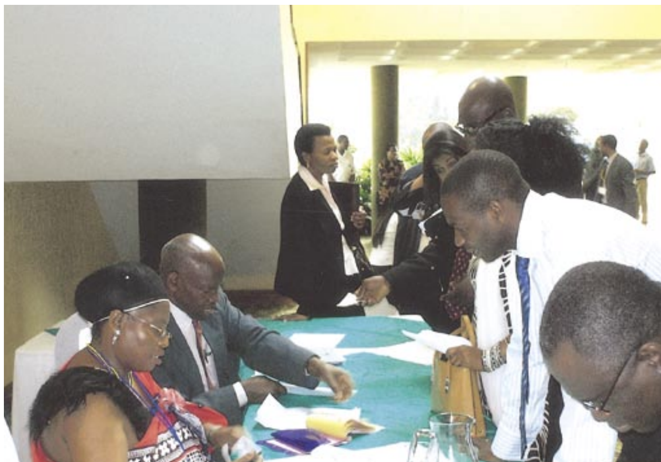
Delegates registering for the 29th AAPAM Roundtable Conference, Mbabane, Swaziland, 3-7 September 2007.

The times indicated above are the local East African Standard Time, which is approximately 3 hours ahead of GMT.