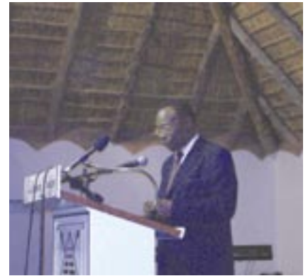
Prof. Adebayo Adedeji, CFR, making his acceptance speech

MBABANE, SWAZILAND, 3rd September 2007 – Today Professor Adebayo Adedeji, CFR was awarded the first AAPAM Gold Medal by the African Association for Public Administration and Management (AAPAM). The Rt. Hon. Absalom T. Dlamini, Prime Minister of the Royal Kingdom of Swaziland, presented the award during a special ceremony held at Ezulwini Valley, Mbabane.