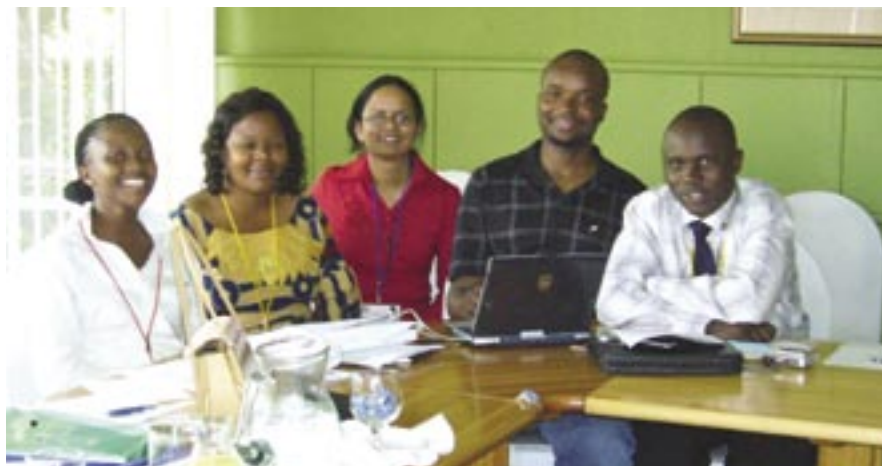
Some of the Young Professionals in a meeting at the conference.

The YP appreciate the fact that the conference presentations and deliberations have been very comprehensive in terms of imparting a thorough understanding of the concept of effective leadership and its key elements. For example the presentations on Strengthening Leadership Capacity during Plenary Session 7 satisfied our expectations.