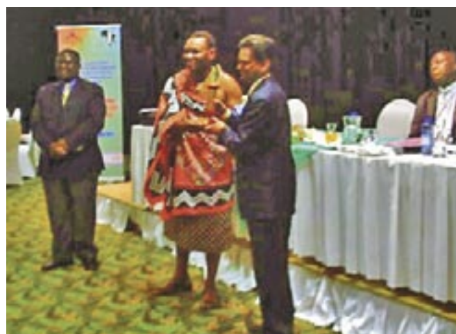
SILVER TROPHY. Ministry of Civil Service and Administrative Reforms. Spearheading administrative reforms through innovative package in Mauritius.