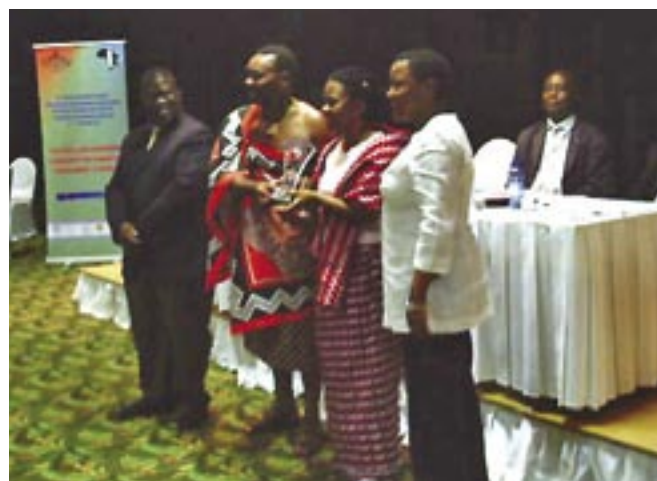
GLASS TROPHY. National Emergency Response Council on HIV/AIDS, Swaziland. Helping communities help themselves: Swaziland Innovative Community-based response to HIV/AIDS.