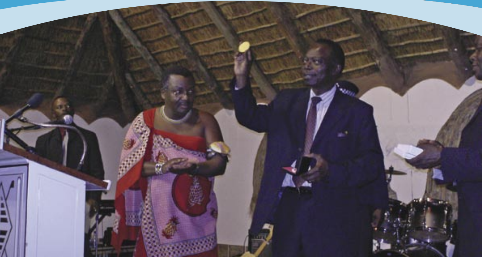
Prof. Adebayo Adedeji receives the AAPAM Gold Medal from His Excellency Absalom T. Dlamini, the Rt. Hon Prime Minister of the Royal Kingdom of Swaziland during the 29th AAPAM Roundtable Conference held in Mbabane, Swaziland, 3-7 September 2007