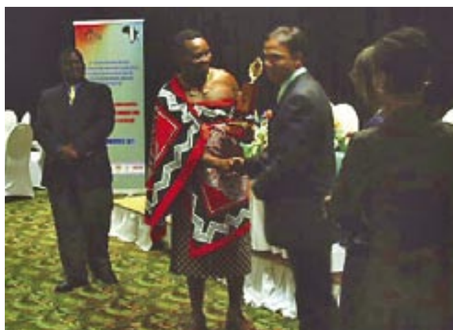
GOLD TROPHY. South African Service. Rural Mobile Community Service Centre.