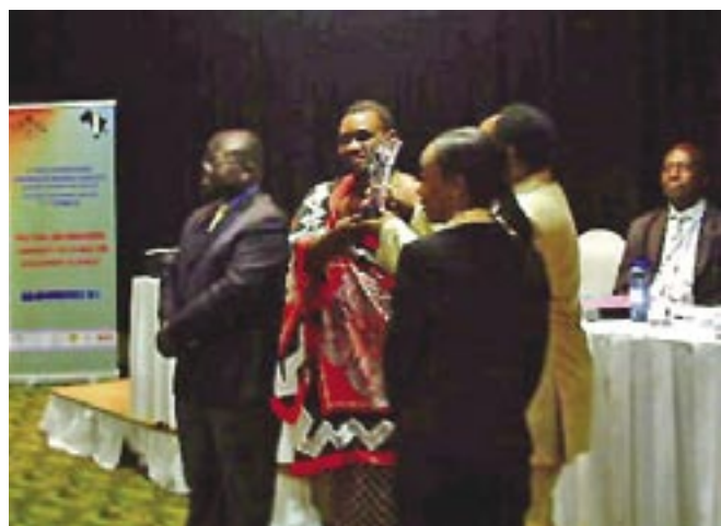
GLASS TROPHY. Business Registration and Licencing Agency (BRELA). Reduction for the Road Map to Access the BRELA Services in Tanzania.