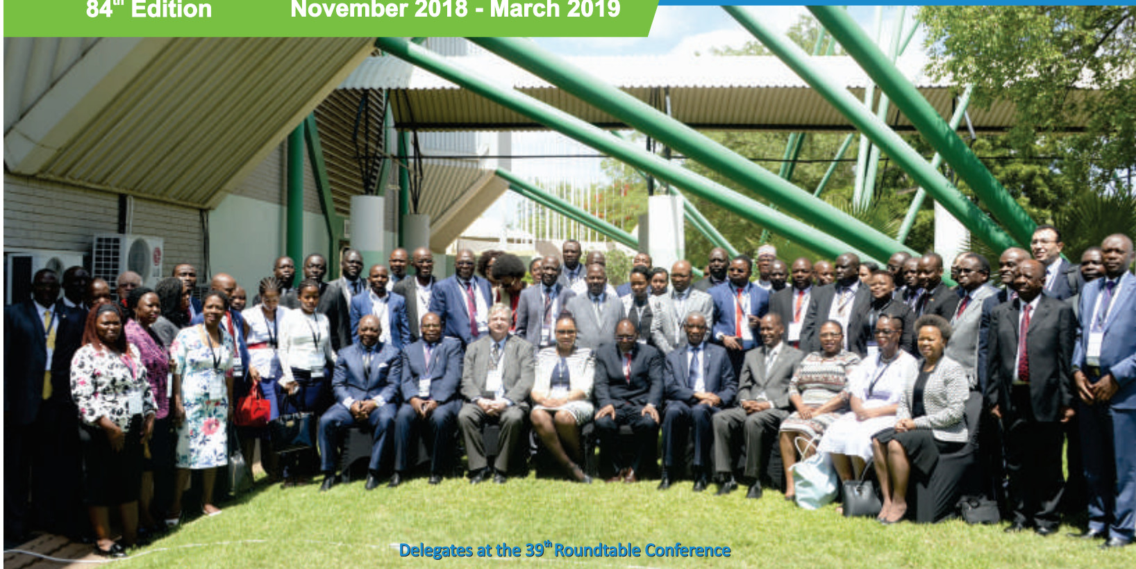
Delegates at the 39 th Roundtable Conference