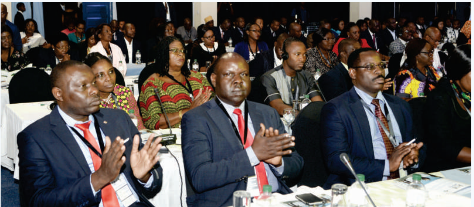
A section of the delegates at the 39 th Roundtable Conference Sessions

Botswana offered the delegates an experience like no other. From the efficiency of the National Organizing Committee (NOC) to a well packed and coordinated conference. We salute the commitment, team spirit, friendliness and unparalleled efficiency of the Botswana hosting team. Gaborone offered the delegates a unique experience of African efficiency and good governance in practical sense.