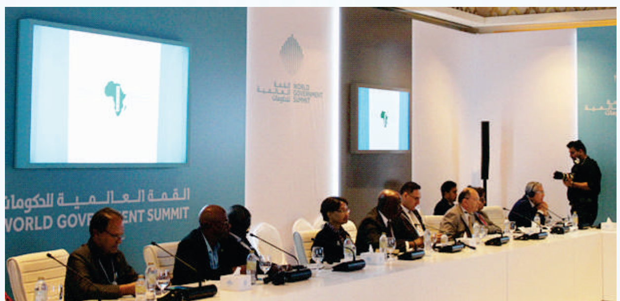
Some of the delegates attending the Ministerial Round-table side event during the WGS