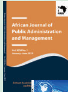
African Journal of Public Administration and Management (AJPAM) Vol. XXVI No. 1 January - June 2019