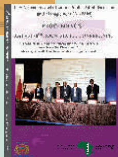
38 th Roundtable Conference Report