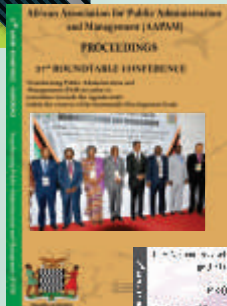
37 th Roundtable Conference Report