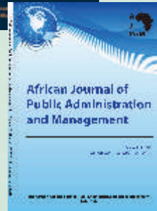
African Journal of Public Administration and Management (AJPAM) Special Edition Vol. XXV No. 2 January - June 2018