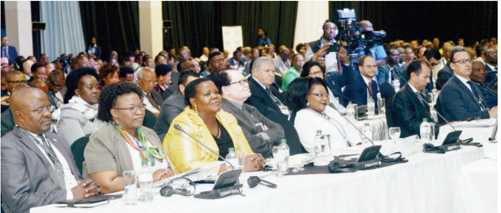
Opening ceremony of the 39 th Roundtable Conference

The African Association for Public Administration and Management (AAPAM) in collaboration with the Government of Botswana through its Directorate of Public Service Management (DPSM) held its 39 th Annual Roundtable Conference between 6 th to 9 th November, 2018 at Fairgrounds Holdings in Gaborone, Botswana. The four-day international conference was hosted also in collaboration with other institutions like the University of Botswana and Botswana Public Service College (BPSC). The Government of Botswana was hosting an annual AAPAM conference for the third time having hosted the 1987 and 1997 Annual Roundtable conferences in the past.