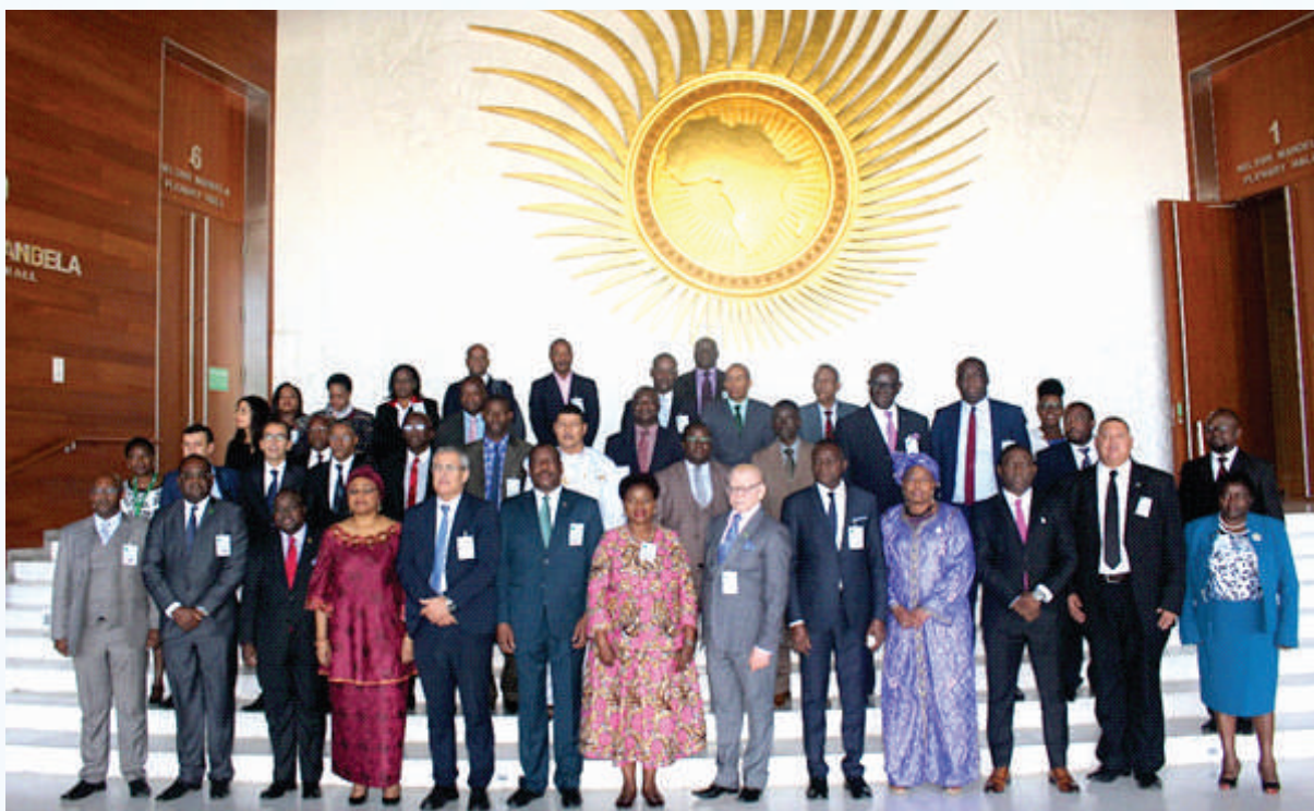
A group photograph of Ministers and some of the experts who attended the 3 rd Ordinary Session for STC-8 in AU Headquarters, Addis Ababa, Ethiopia.

An expert meeting preceded the ministerial session. The three AU-STC 8 sub-committees comprising Public Service; Decentralization and Local government; Urban Development and Human Settlements presented progress reports on activities undertaken within the 2017-2018 period. The reports also highlighted challenges faced in the implementation of activities.